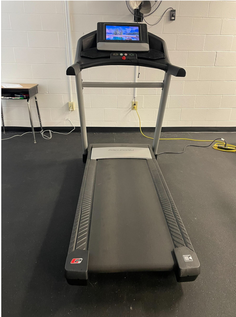
5. Padded Bench (pictured below)