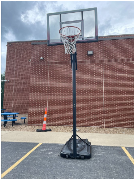
Lifetime Basketball hoop #2 (pictured on the left)