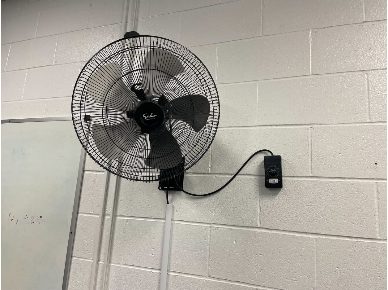
12. Deluxe Simple Wall mounted Deluxe Fan #2 (pictured below)