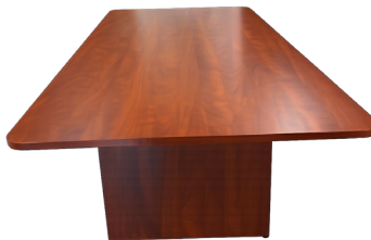
Table 1: approximately 8 ft long by 3.5 ft wide (pictured to the left)

large rectangular conference table with cherry wood laminate finish (by the individual table)