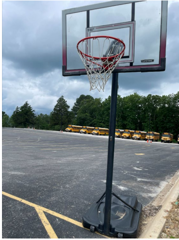
Lifetime Basketball hoop #1 (pictured on the left)