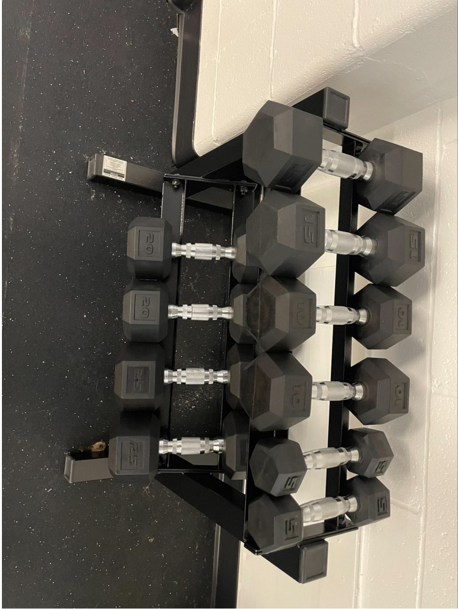
8. Weight Set #2 (5#, 10#, 15#, 20#, 25#) (pictured below)