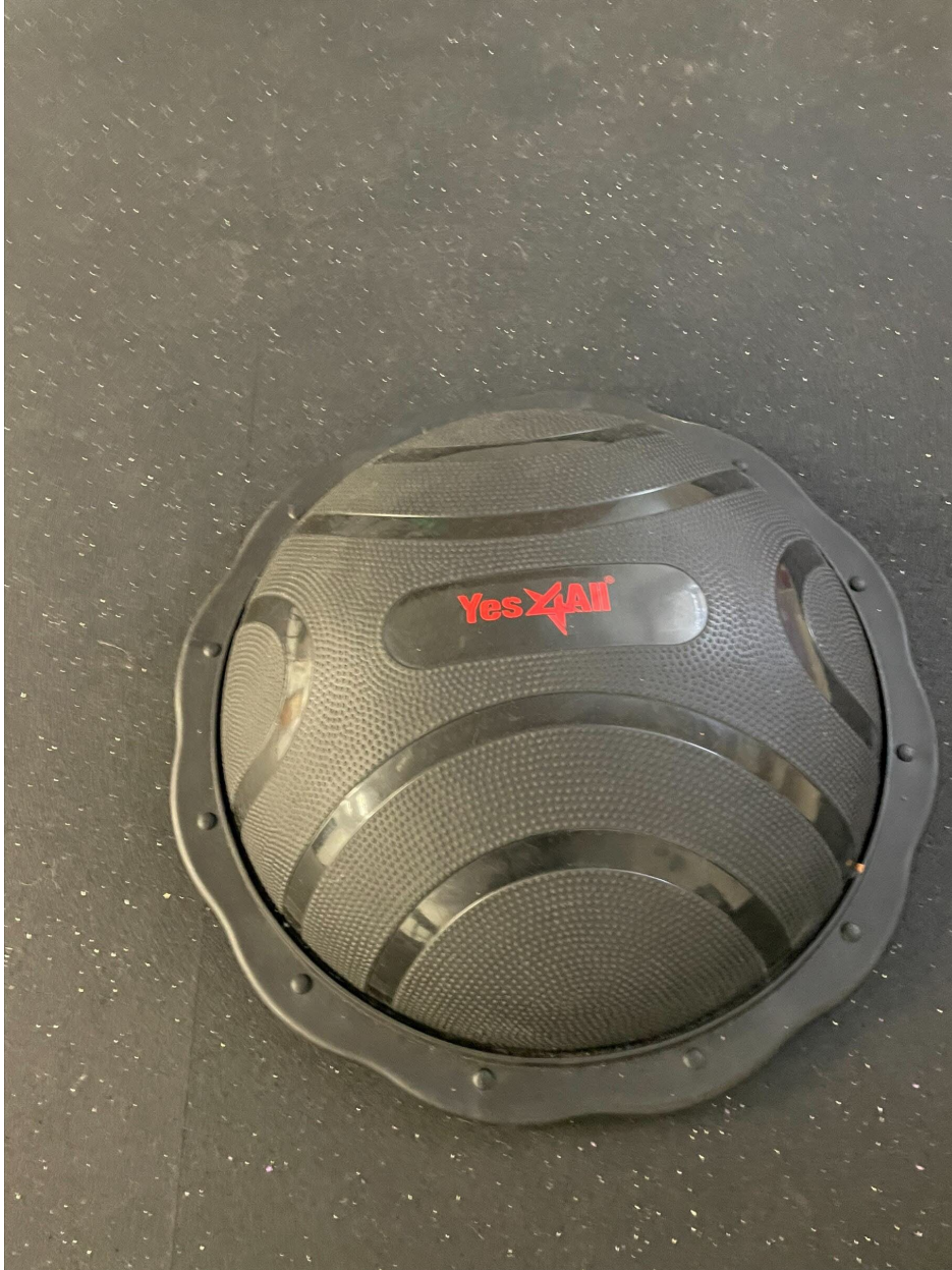
10. Battle Rope (w/o mounting hardware) (pictured below)