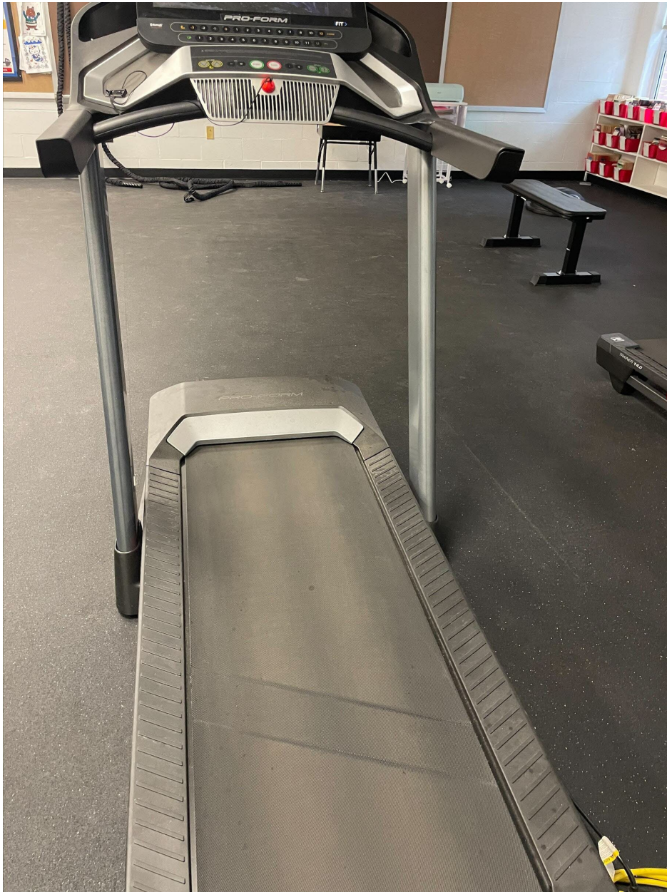
4. Pro-Form Trainer 14.0 Treadmill (pictured below)