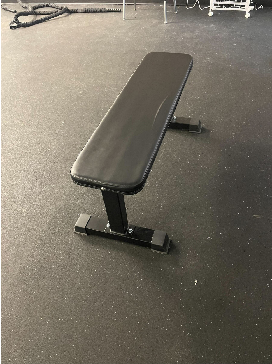
7. Weight Set #1 (5#, 10#, 15#, 20#, 25#) (pictured below)